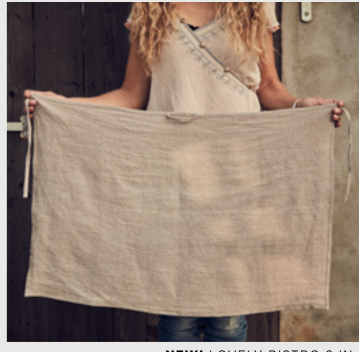
NEW! LOVELY BISTRO 2 IN 1 100 % EUROPEAN LINEN